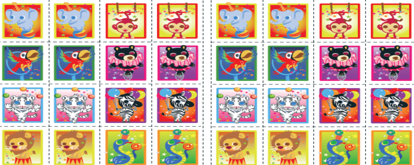
Play a Memory Game!