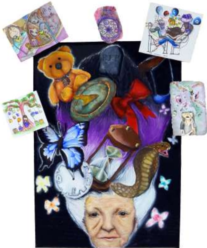
Certificate of Recognition—Category C (Lynn Wong)

The SYF 2017 Art Exhibition was held from 5 July to 16 July 2017. Held biennially as a platform to showcase and celebrate artworks created by primary school pupils, over 3400 pupils nationwide participated in the event this year.